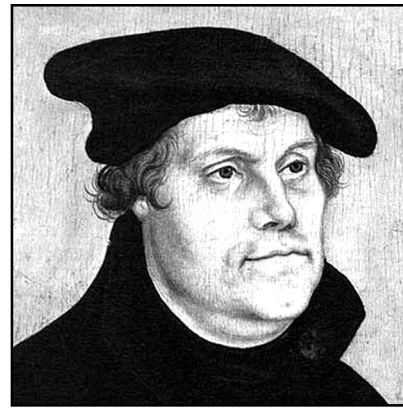
Martin Luther, 1535

The span of years between these two dates is 399. Is there meaning to this perhaps? We noticed that this was shy, by one year, of a nice, round, 400 years. But there it is, 399, rather than 400. Some time later we observed that the chronology of the Hebrew Old Testament, treated in our on-going series on Chronology, established the time between Adam and Christ as exactly 3990 years, from 3958 BC to Jesus' death at Calvary in 33 AD.